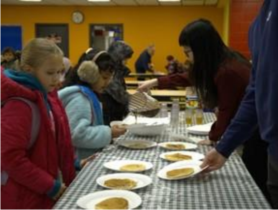
Figure 1: General Brock in the News!

As we approach the summer, we are into our final two months of what has been another incredible year at General Brock. This time of year is an exciting one for everyone, with the great memories of a year of progress, fun, and hard-work, and the anticipation of a summer break followed by a new year of endless opportunity.