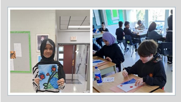
Figure 2 - Paint Station at Community Night

The end of April saw us celebrate with our annual “Community Night”. This event allowed us to welcome all our families, both current and future, into our school to join with a series of fun activities and to spend time interacting with our staff. We continue to be committed to providing every opportunity we can to gather as a