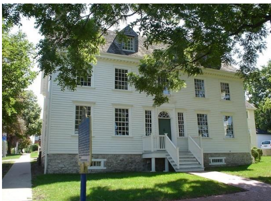
Figure 3- Duff Baby House, Photo Credit Embee473 at the English-language Wikipedia, CC BY-SA 3.0, https://commons.wikimedia.org/w/index.php?curid=36295885

The Duff Baby House is located at 221 Mill Street. The Georgian-style house is owned by the Ontario Heritage Trust and is considered to be one of the oldest standing structures in Ontario. The house was built between 1792 and 1798 by Alexander Duff as a fur trade post. In 1807 the building was bought by James Baby and it is alleged to have been used as the headquarters of U.S. General Harrison, Colonel Henry Proctor, and General Isaac Brock until it was ravaged by the British during the War of 1812.